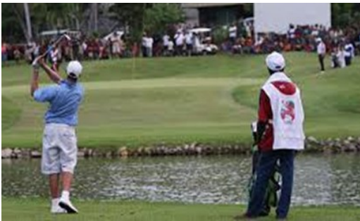
Golfers at the Royal Port Moresby Golf Course

The Royal Port Moresby Golf Course will be the venue for the Golf competition at the 2015 Pacific Games. It will be refurbished for the Games and will see all 22 countries participating in the Games take part in the competition in various categories. Besides the Golf Course other minor venues will be the June Valley Shooting Range. It will be undergoing renovations which will see a wonderful new complex to host the shooting events at the Games. Finally the Port Moresby Racquet Club will also begin its renovations shortly which will see a fantastic new venue that will host the tennis and squash competitions during the 2015 Pacific Games in July next year.