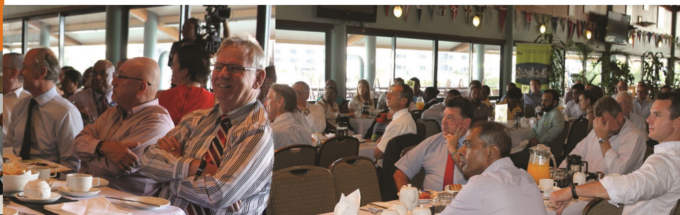
Representatives from Business Houses who attended the breakfast