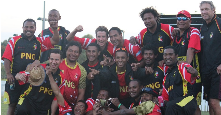
Barramundi's with the Asia-Pacific Rising Stars Trophy which they won in 2013 in Australia