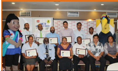
Representatives of TB Partners including GOC with their Certificates

The 2015 Pacific Games partnership with other stakeholders in the fight against TB was recognized during a certificate presentation to all partners. The GOC joined NCD Health Services and World Vision International in their advocacy campaigns to bring awareness to individuals, families and communities on the need to stop the spread of TB in the city, with Tura combining with TB mascot Dotsy as advocates.